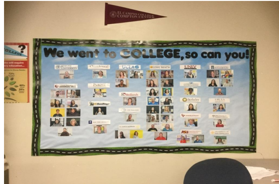
Thinking Maps and college awareness merge at Zamboni with bulletin board highlighting teacher college paths.