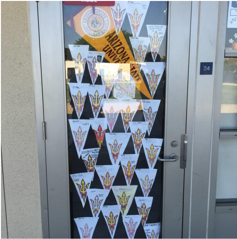
College -themed door decorating contest at Jackson.