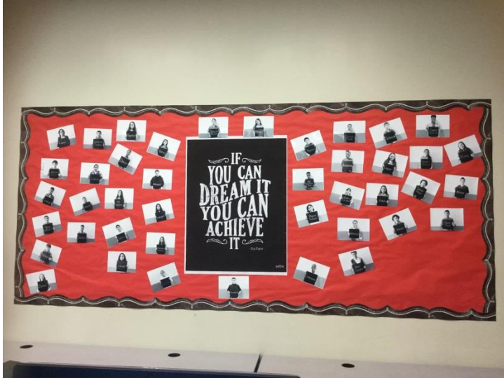
Zamboni School Computer Lab